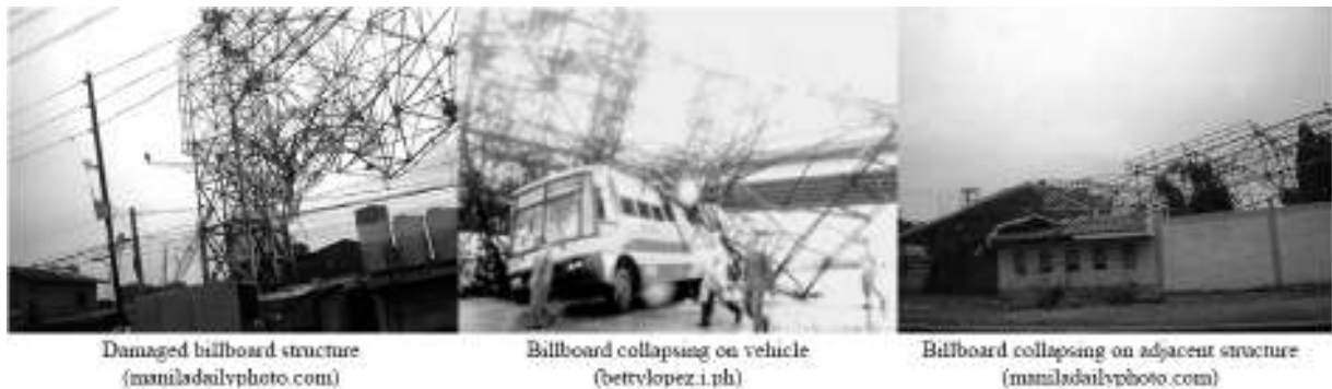
Figure 2. Selected photos of billboard structures damaged due to Typhoon Milenyo. (Credits to websites shown above in parentheses)

Typhoon Milenyo was of particular interest to structural engineers and those concerned with wind effects on structures, mainly because many billboard structures in Metro Manila collapsed. Example photos of damages due to Typhoon Milenyo were included in last year's Philippine country report for the APEC-WW (Pacheco et al, 2006) and more were presented at the workshop. Some of these are again shown in Figure 1. Notice that certainly, these damaged structures are generally lightweight structures.