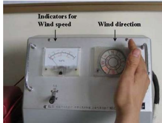
Fig. 3b: EL- anemometer, Indicators (Indoor)