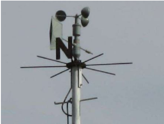
Fig 3a: EL Anemometer, Sensor (Outdoor)

some extreme wind events in records probably were based on assessment by Beaufort scale, i.e. man-made data. This is very important point in processing wind data.