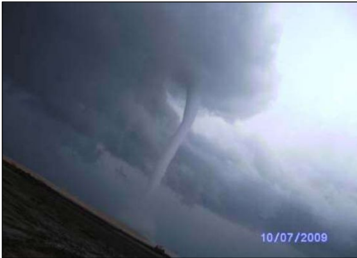
Fig 2: A tornado occurred at Thi Vai Harbor, 10 July 2009

- Topographical winds: Many locations in mountainous areas were subject to down-slope winds. The native people call them “Lao-wind” on the east side of the Truong Son mountain ridges Vietnam-Laos border, “Than Uyen-wind” in Than Uyen-Dien Bien province and “Oquiho-wind” in Sa Pa-Lao Cai province, etc. ( http://www.thoietnguyhiem.net/ ).