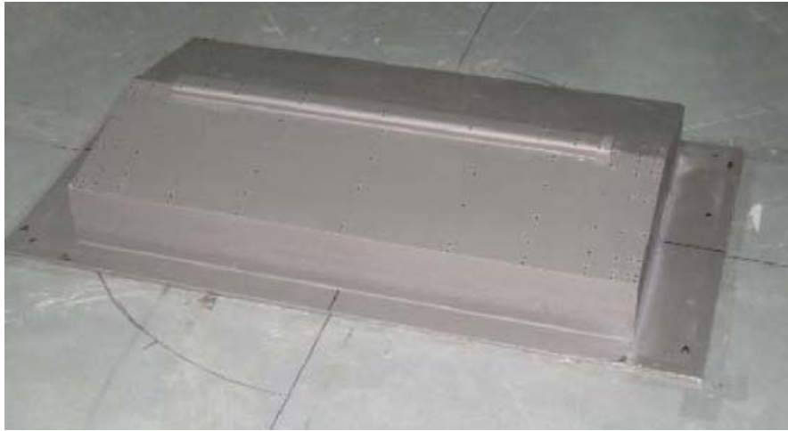
Figure 2 Testing model of an industrial building