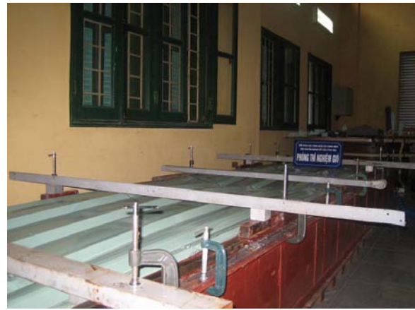
(b) Deformation shape of a steel profiled sheet at ultimate failure load