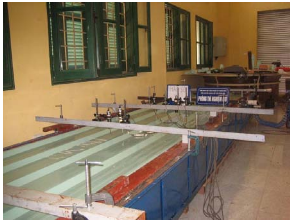
(a) Equipments for testing of steel sheets

In Vietnam, steel profiled sheets are used popularly for roofing system of low-rise industrial buildings. The test for structural performance of them under wind loading is necessary. Recently, testing of 24 steel profiled sheets has been done to determine their load response characteristics and ultimate failure load under uplift conditions per ASTM E 1592-05. The detail results of these tests can be found at Trung (2010). Testing system includes an air box (0.5m high, 1.2 m wide and 0.5 m deep) and an air-pump system, and two manometers, and 6 displacement transducers and a data-logger system (see Figure 4a). Deformation shape of steel profiled sheet at ultimate failure load is displayed in Figure 4b.