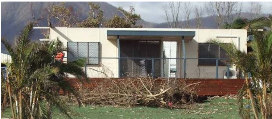
Figure 3. Cyclone Yasi: Roof loss after door failure

Failed elements, such as roof structures, cladding sheeting, tiles, awnings, guttering, flashings, and roller doors, as well as unsecured items stored in residential yards and vegetation were entrained in the wind stream. In some cases the roofing elements travelled hundreds of metres, highlighting the threat to life safety and potential for further damage to other structures. Figure 3 shows a house in which screens had been installed to protect windows, but in which a door had failed and still caused the high internal pressures that initiated the roof loss. Where the structure had been designed for low internal pressures, roof loss followed the creation of a dominant opening which was often caused by: failure of door furniture (latches, bolts, hinges); failure of window frames or frame anchorage; failure of garage doors under wind pressure; or failures of windows, doors and cladding under wind-borne debris impact.